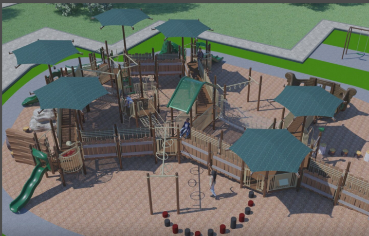
Initial Concept Drawing 2022

Friends For Fantasy Forest (FFFF) was recently established to re-create the existing Fantasy Forest playground at the City Park. The FFFF includes the St. Johns Parks and Recreation Dept., SJACF, and members of Kiwanis, and Rotary Club and is tasked with planning and fundraising to make the project a reality.